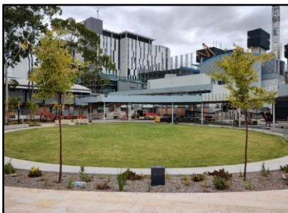
Construction underway for 'KidsPark'