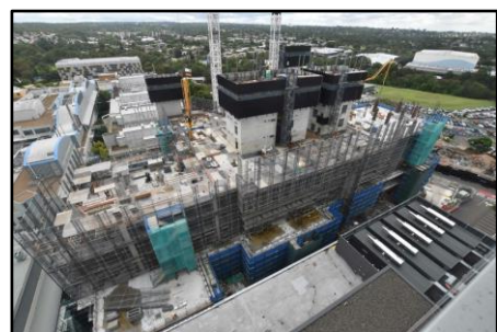
Paediatric Services Building

For more information visit our website via the QR code below, or at: