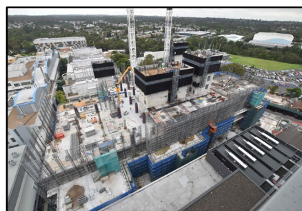
Paediatric Services Building

For more information visit our website via the QR code below, or at: https://westmeadkidsredevelopment.health.nsw.gov.au/