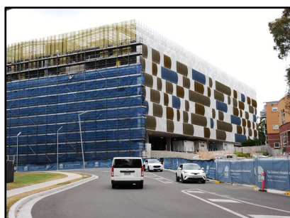
Façade of the new multi-storey car park