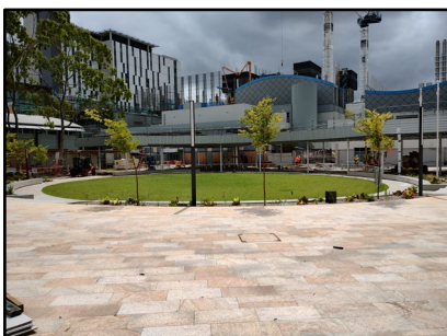
Construction underway for 'KidsPark'