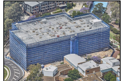
Site of new multi-storey car park

For more information visit our website via the QR code below, or at: