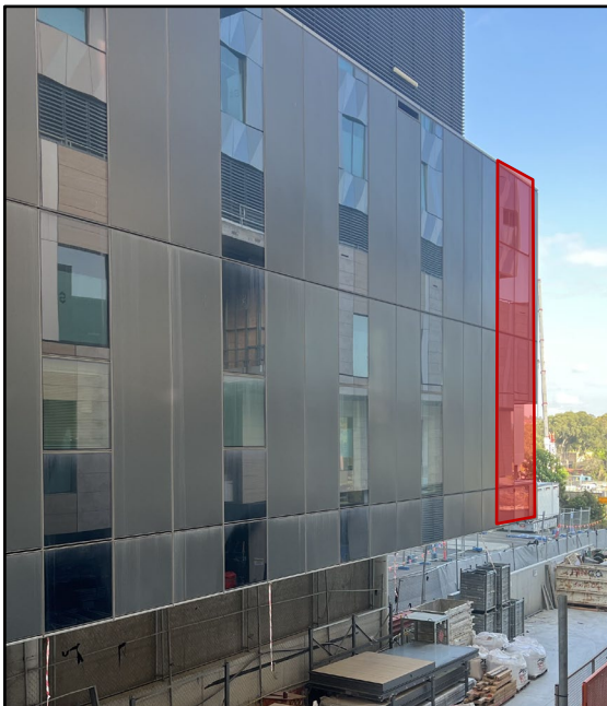
Image: Location of work area on Block K

These connections form part of the NSW Government $619 million investment into The Children's Hospital at Westmead redevelopment which includes a new 14-storey building to provide new and expanded critical and acute healthcare services, multi-storey car park, revitalised 'KidsPark' forecourt and refurbishment of some areas of the existing hospital.